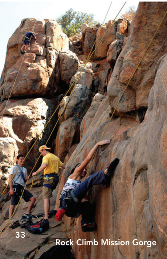
Rock Climb Mission Gorge