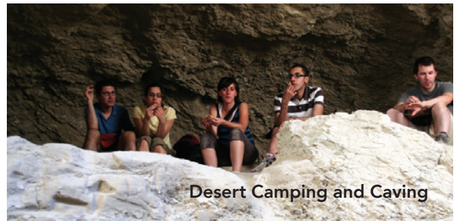
Desert Camping and Caving