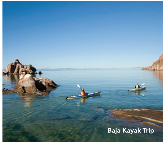
Baja Kayak Trip

Here's a sampling of some of our most popular group adventures: