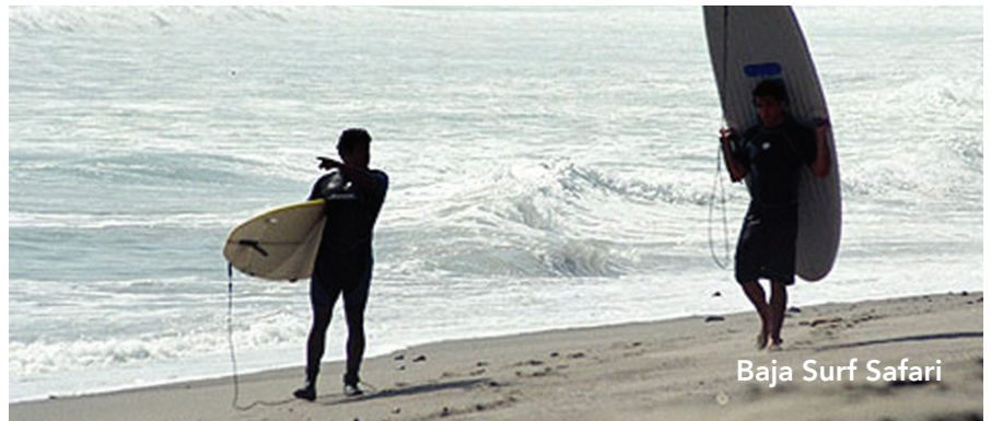
Baja Surf Safari