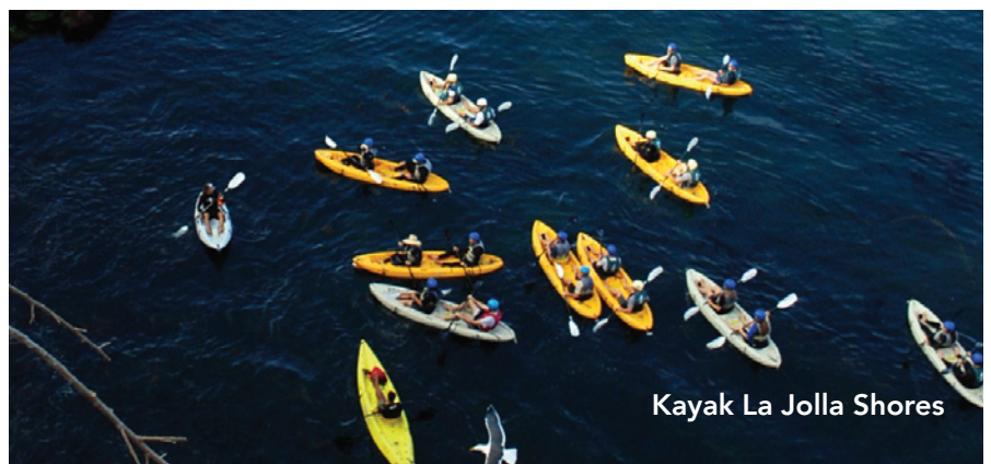
Kayak La Jolla Shores